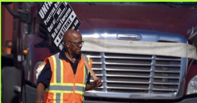
My father standing strong on the picket line

When I was five years old, I was handed a small Kaiser card with my name and a number on it. I still have the same Kaiser card number today. That little piece of plastic isn't just a card, it's a testament to the stability and security that union benefits provide. My dad was a proud U.S. Postal Worker and an even prouder union member, and because of his union job, our family had reliable healthcare, steady pay, and peace of mind. We didn't worry about whether we could afford a doctor's visit or if my dad's job would disappear overnight. Those benefits weren't just perks, they were lifelines that shaped the way we lived, grew, and planned for the future. I had asthma as a small child, and I can still remember the great care I received from Kaiser. Today, when I look at the healthcare cuts being proposed, I think about families like mine, families who rely on that same stability. It reminds me that the fight for strong union contracts isn't just about wages, it's about preserving dignity, security, and a better life for generations to come.